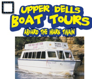
1 hour Upper Dells Glacial Park