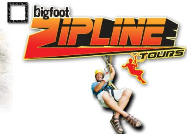
6 Zipline Canopy Tour

Circle Card Type: MasterCard Visa Discover