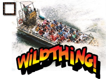
1 hour Upper Dells Glacial Park